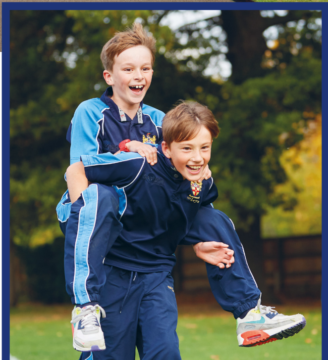
Life at The Leys

The Leys is a co-educational boarding and day school for pupils aged between 11 and 18. Set in the heart of the beautiful and stimulating city of Cambridge, one of the world's leading cultural and academic centres, The Leys' unique location allows pupils unrivalled access to the vast array of cultural and educational opportunities that Cambridge has to offer.